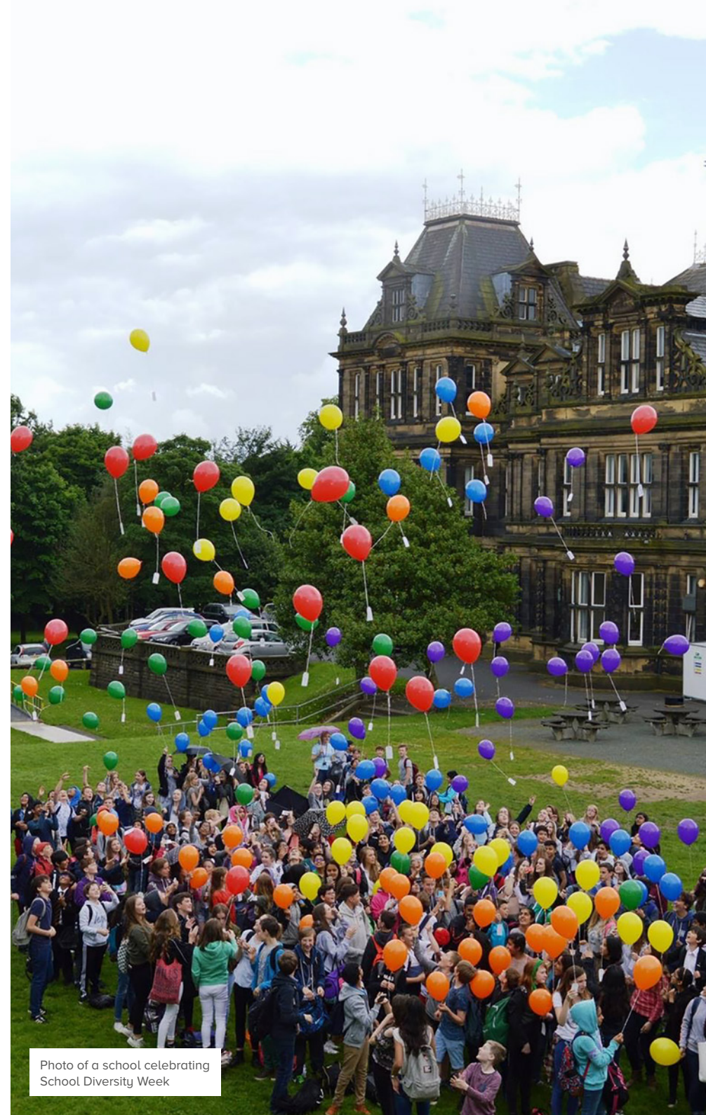
Photo of a school celebrating School Diversity Week